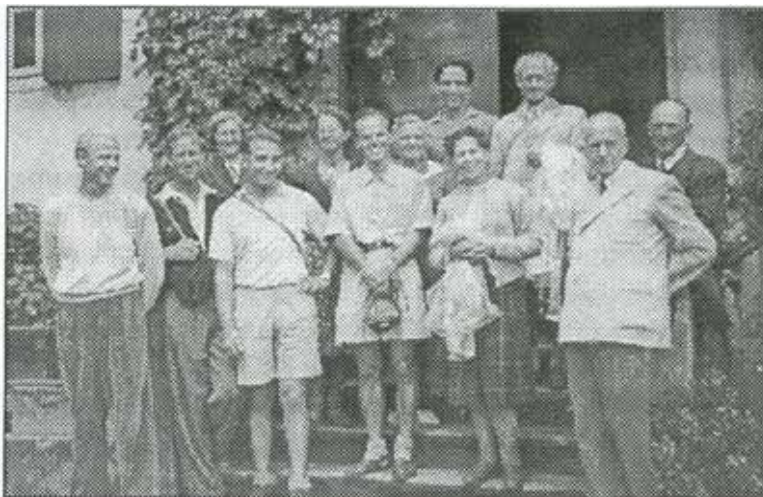
First Peace Builders International Conference, Hamburg, Germany Out of which came the name "Servas" (1952)

After three months in Pakistan and six in India I got a letter from my Birmingham friends announcing the first international Peace Builders (Servas) conference and urging me to attend.